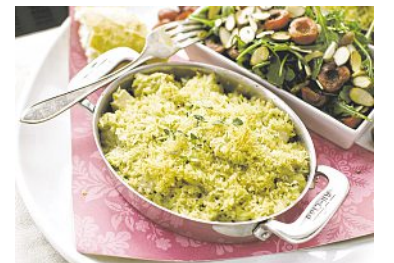
Crab and hearts of palm gratin offers easy elegance for a meal at home.

While the gratins bake, make the salad. In a medium bowl, whisk together the olive oil, vinegar, mustard and maple syrup. Add the arugula, cherries