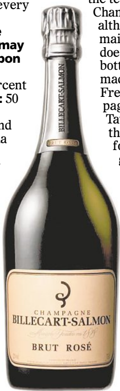
Champagne Billecart-Salmon brut rosé

maine Carneros does for this bottling. It's made by the French Champagne house Taittinger, though, so we'll forgive. A great value brut sparkler, perfect for any occasion and affordable enough to drink as everyday wine.