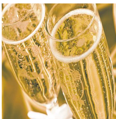
Flutes of sparkling wine are a classic accompaniment to romance. RGJ FILE

If you're offered a glass Champagne (such as on a Valentine's menu), you're very likely being offered a glass of sparkling wine. Champagne sounds far sexier than sparkling wine, but the name can only be applied to the sparkling wines of France made in the Champagne region. Not even other sparkling wines from France can be