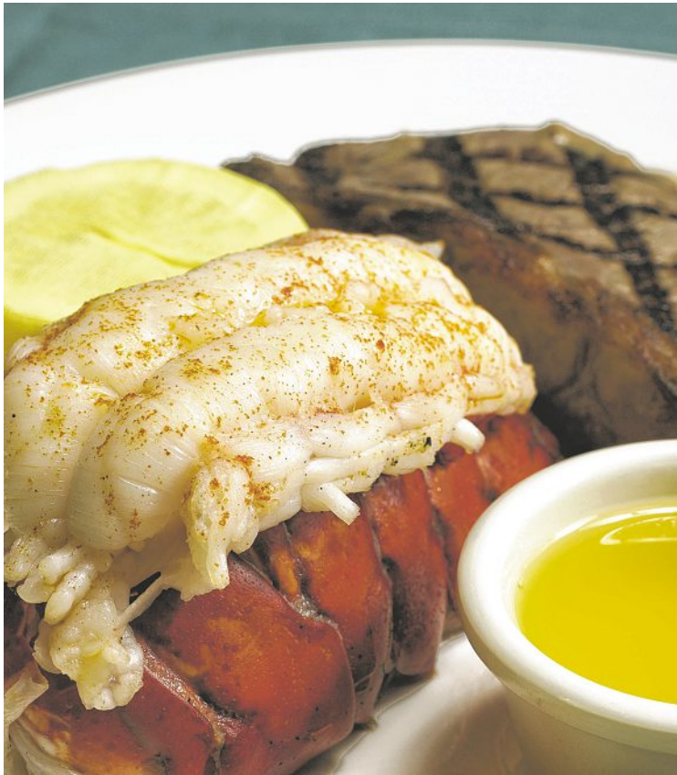
For Valentine's Day, several local restaurants are doing pairings of lobster and beef, a classic duo.

Four-course menu (duo of sea scallop and beef sirloin),