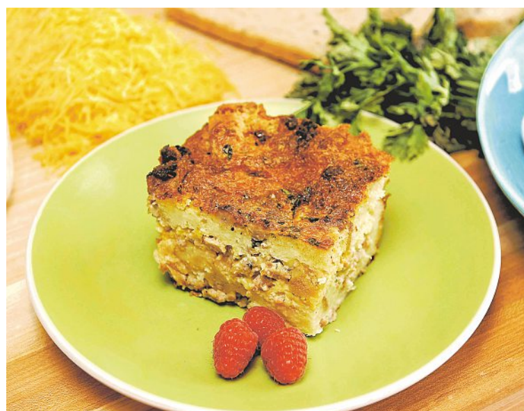
The filling for Christmas morning strata can be chopped meats or sautéed vegetables or a mix of both.