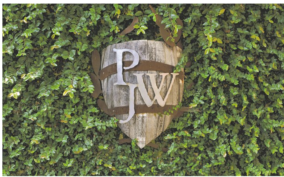
A shield announces PlumpJack Winery on the exterior of the tasting room.