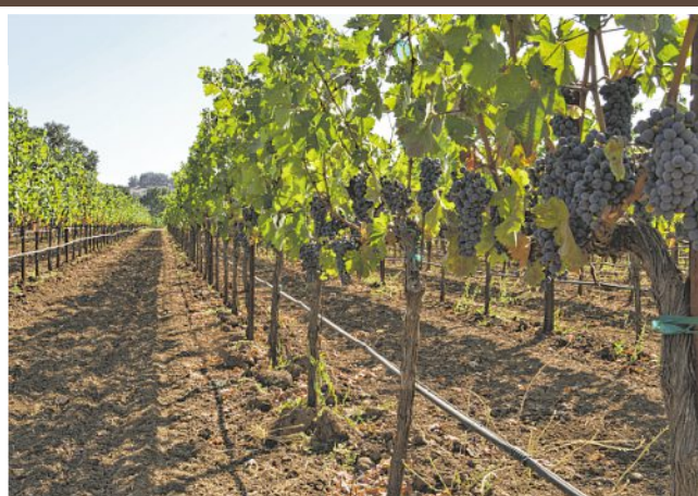
Clockwise from top: Robert Sinskey Vineyards raises lambs; cabernet sauvignon vines at PlumpJack Winery; and the chateau that houses the tasting room and winemaking operations at Chateau Montelena.