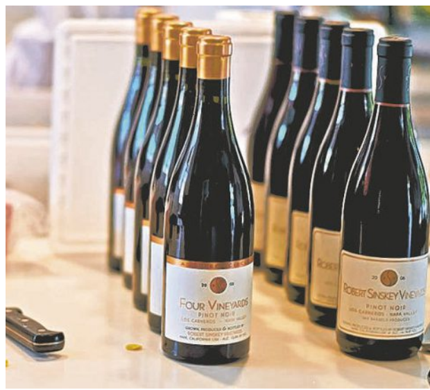
A selection of pinot noirs from Robert Sinskey Vineyards.