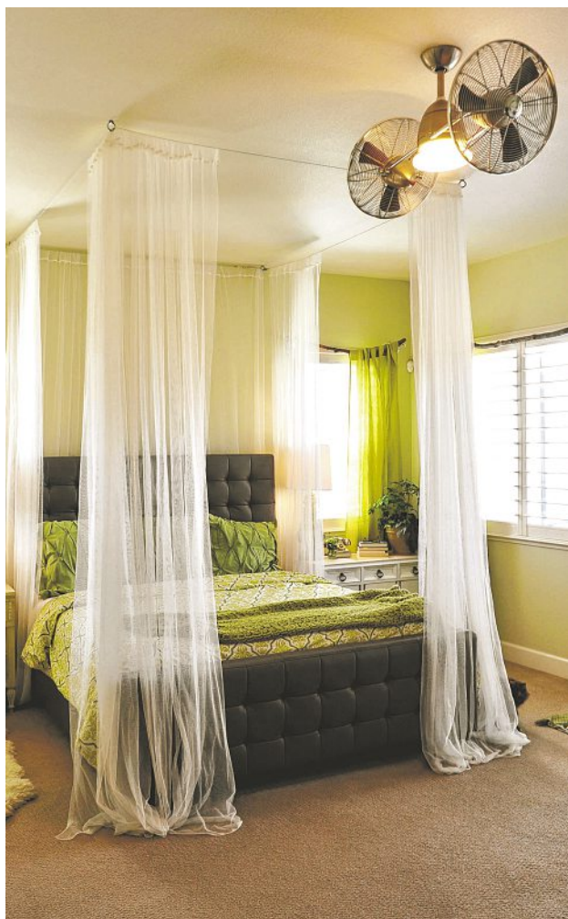
Laura and Dan Durrer's master bedroom. Tree limbs are used as rods for the window coverings.