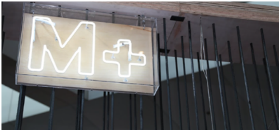
Neon light: M+, the visual culture museum to open in the West Kowloon Cultural District in 2017, exhibiting at Art Basel