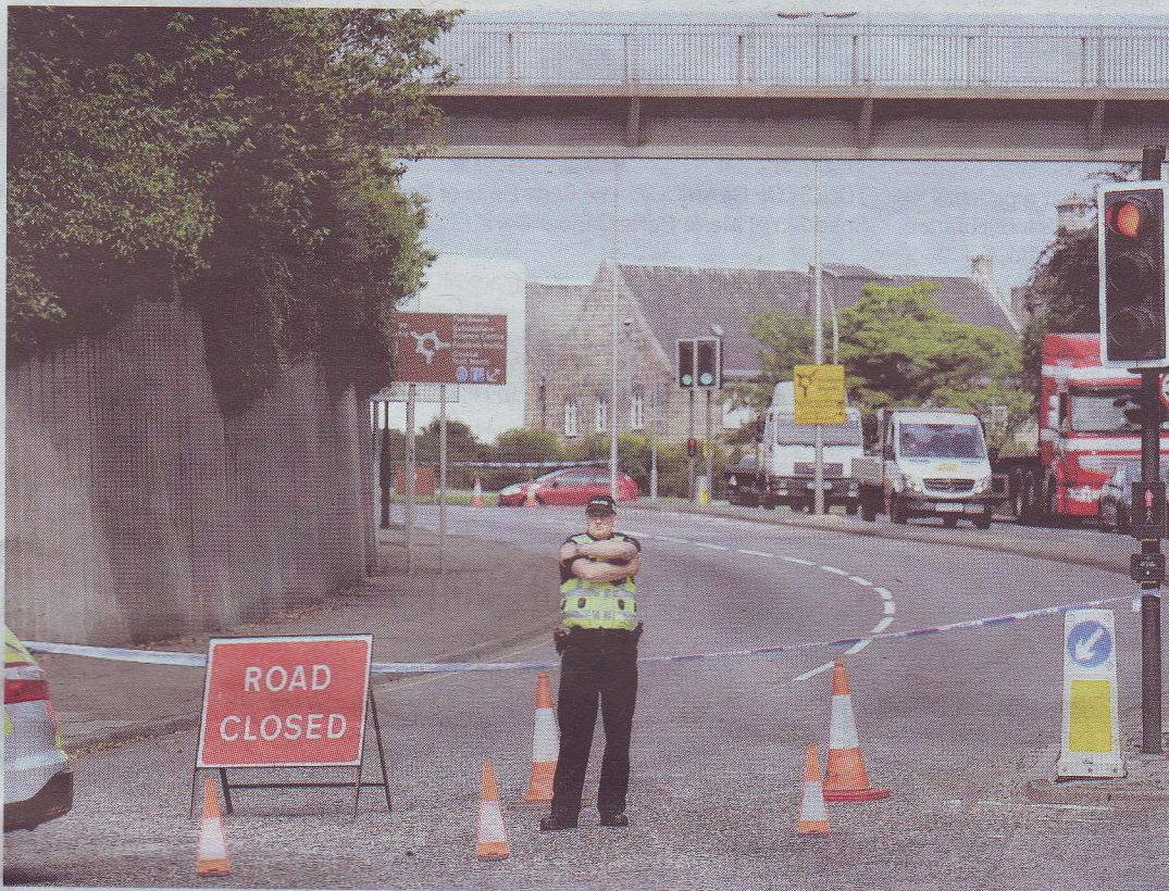
SCENE: A police officer stands guard while investigations are carried out.

The northbound lane of Commerce Street was shut for more than 15 hours while officers made in-