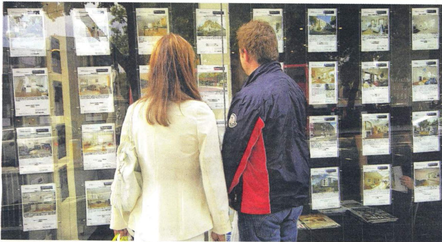
BUOYANT MARKET: Property sales in the north of Scotland are booming, with 16 properties changing hands every day