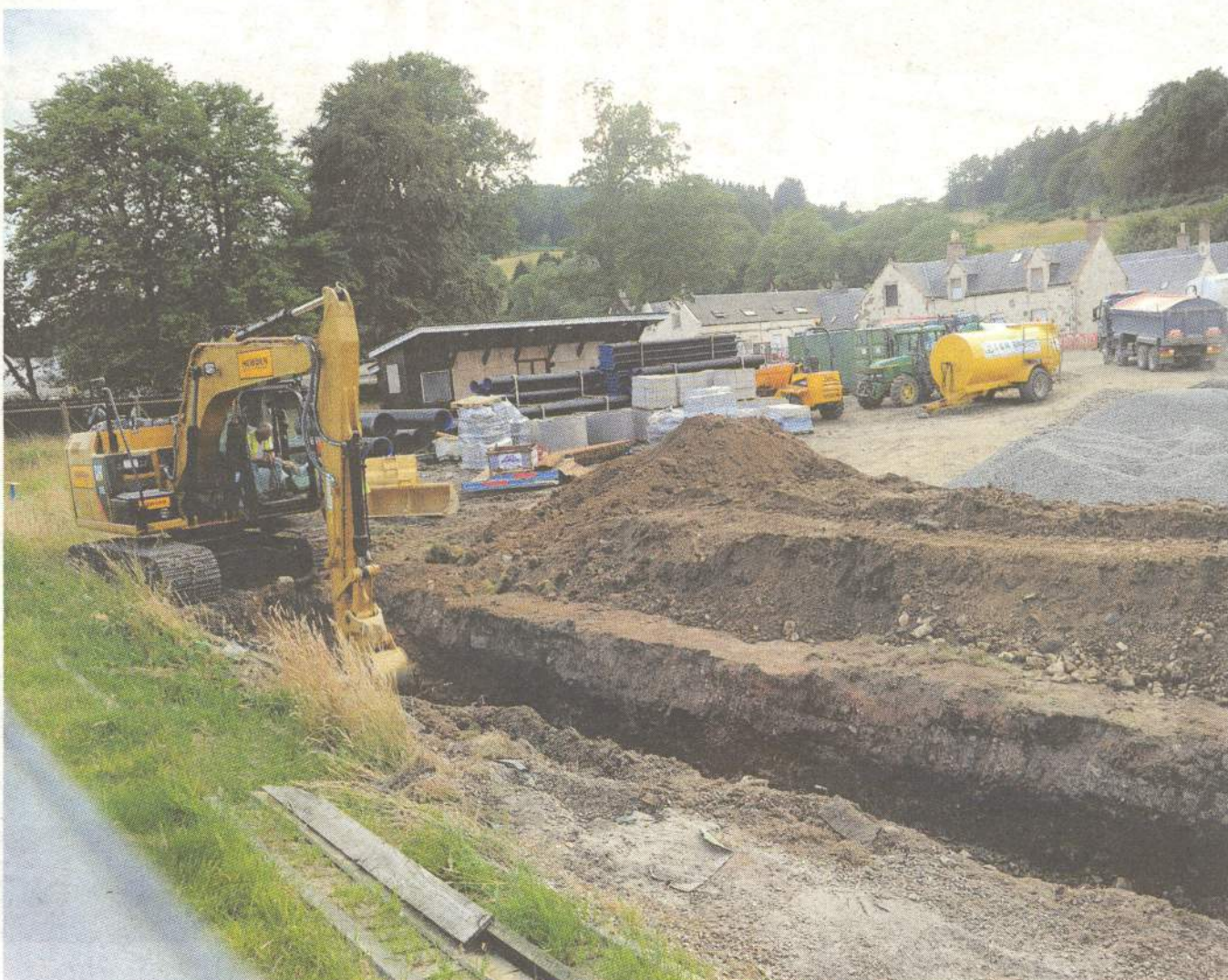
GROWTH: The housing market in the Highlands is booming - and prices remain affordable for many

"Forres is historically a place where people come to retire, or come here from down south, and we've not seen that market so far this year.