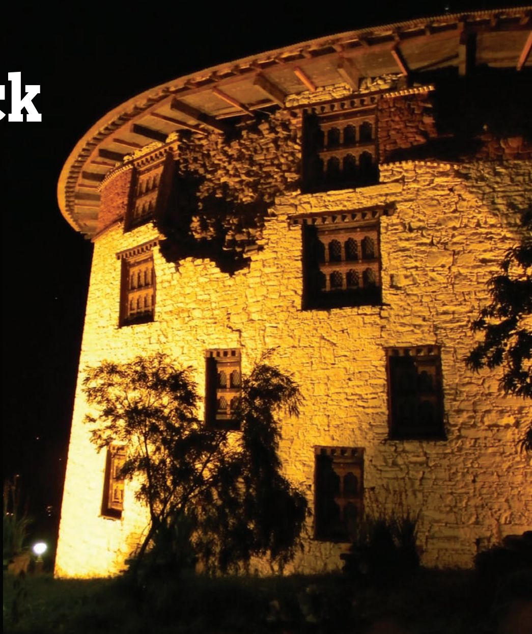
A portion of the Paro Ta Dzong wall come apart (more photos on Pg. 9)