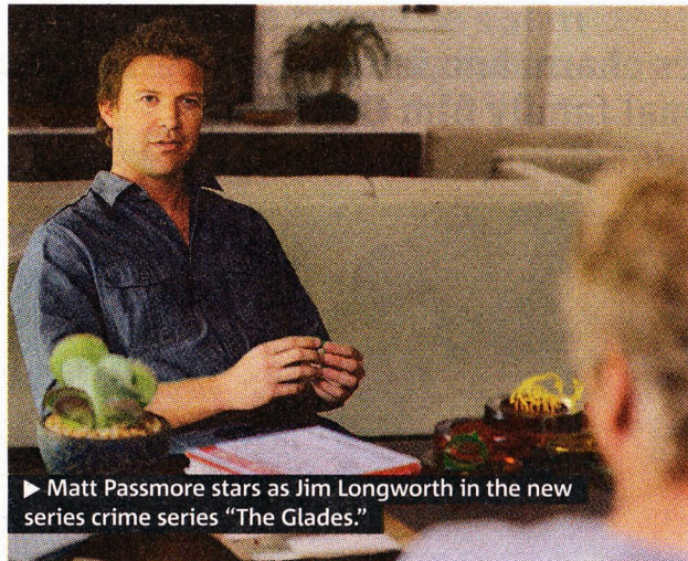
► Matt Passmore stars as Jim Longworth in the new series crime series "The Glades."

"As long as he gets what he wants, this guy doesn't care what anyone thinks of him," Passmore says.