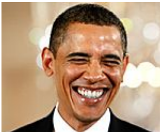
Economist: Prepare for Massive Wealth Destruction (Shocking... Newsmax