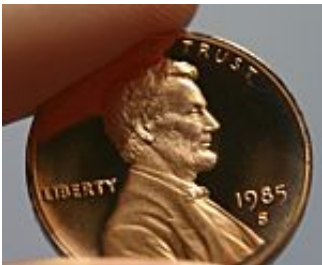
Little Known Way to Pay Off Mortgage Weekly Financial Solutions