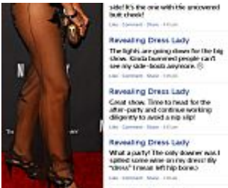
Best Dressed? Did This Globes Attendee Get Dressed At All?