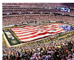
VOTE: Will Seahawks Stop Peyton Manning At Superbowl XLVIII? Hubub