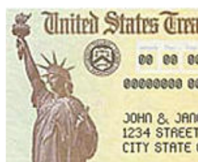
Homeowners Get a Bailout This Year Lifestyle Journal