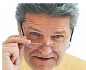
The 19 Must Have Stocks in 2014 Newsmax