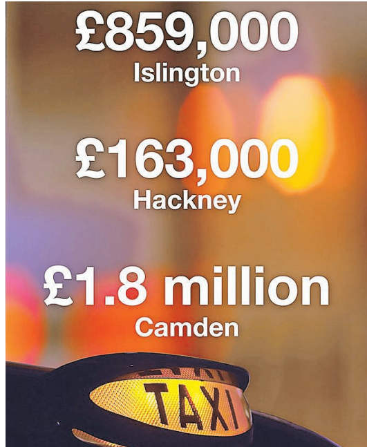
■ How much Islington and its neighbours spend on taxi fares