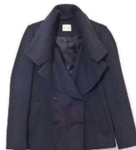
dkny jeans, $128