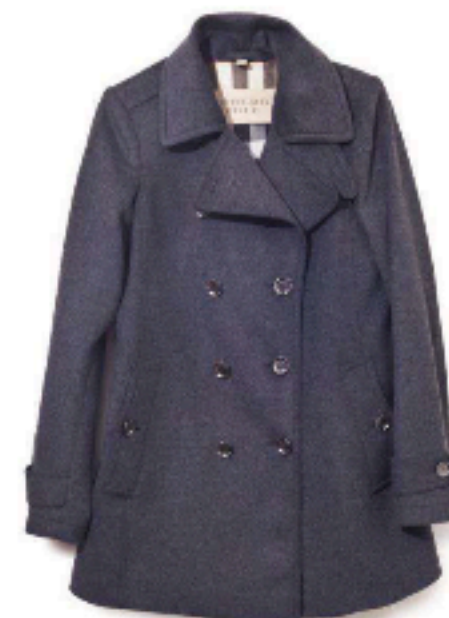
barberry brit, $795