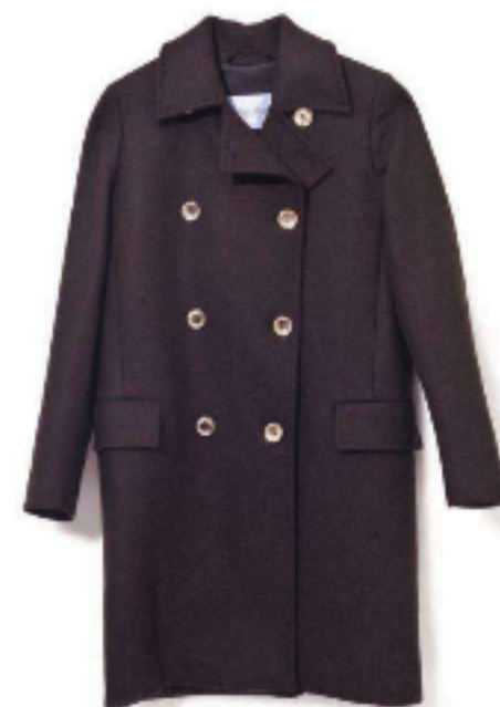
max mara, $2,300