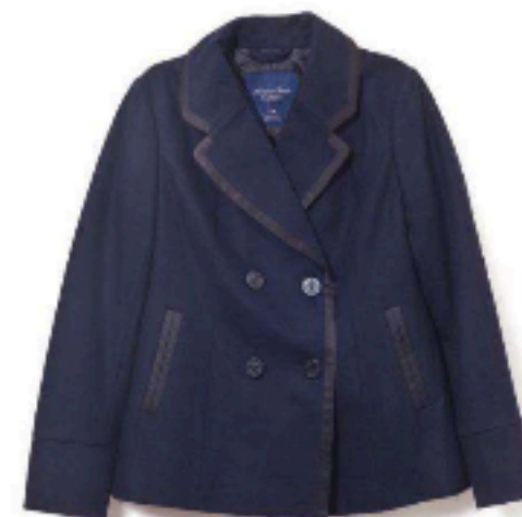
american eagle outfitters, $110