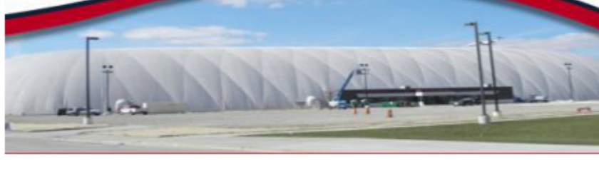
A facility similar to the Dome at the Ballpark in Rosemont is proposed for Grayslake.

15 Comments • Recommend • Like 21 Tweet 3