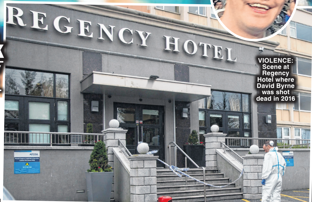
VIOLENCE: Scene at Regency Hotel where David Byrne was shot dead in 2016

He also agreed to repay €43,353 in unemployment assistance he was not entitled to in November 2002.