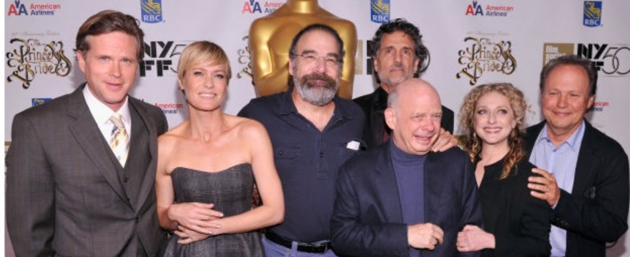
Elwes, Robin Wright, Mandy Patinkin, Chris Sarandon, Wallace Shawn, Carol Kane, and Billy Crystal celebrating the 25th anniversary of The Princess Bride at the New York Film Festival in 2012.

Miracle Max's hovel was probably the funniest. Rob basically told Billy Crystal to throw away his lines and just improvise which is when he started doing medieval Yiddish 'stand-up'. First Rob was banished from the set, as his laugh is very robust. Then I was next since I had to play dead with my eyes closed. He was that hysterical even to listen to. Mandy bruised a rib trying not to laugh.