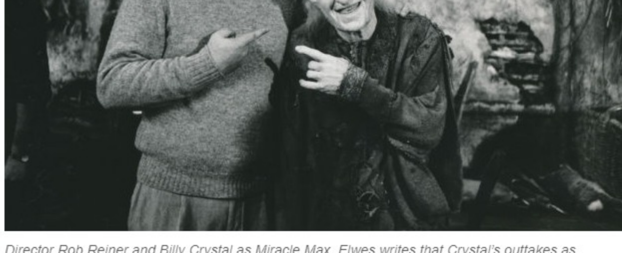
Director Rob Reiner and Billy Crystal as Miracle Max. Elwes writes that Crystal's outtakes as Miracle Max were so hysterical he and Reiner had to watch them from a monitor outside the soundstage.

It really was that fun to make. I can hardly remember a day without laughter. And it all started with Rob Reiner, who is just a beautiful guy.