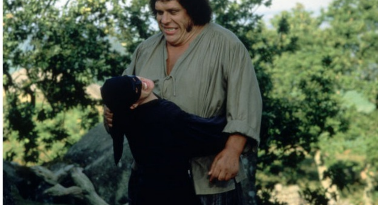
Elwes attempting the Heimlich maneuver on his friend and costar André.

He was as gentle a soul as you'll ever want to meet. A real gentle giant with a heart as big as an ox. I miss him to this day.