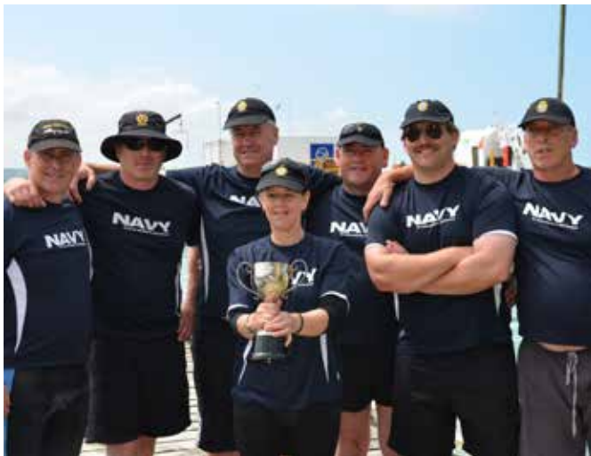
Top of page: HMNZS TOROJA represents in Oamaru.

D unedin-based reserve unit HMNZS TOROJA carried the pride of Otago up to Oamaru to participate in the annual Oamaru Victorian Heritage Celebrations on 18 to 19 November, and take on the Oamaru Rowing Club once again in their annual rowing competition. Occupying a prime spot behind the band in spotless whites, the reservists enjoyed being the subject of audience photography during the parade, as well as plenty of poses for selfies with locals. TOROJA went on to win the rowing competition, retaining the Heritage Rowing Cup - not bad considering their rowing boat is named "Terra Nova". ■