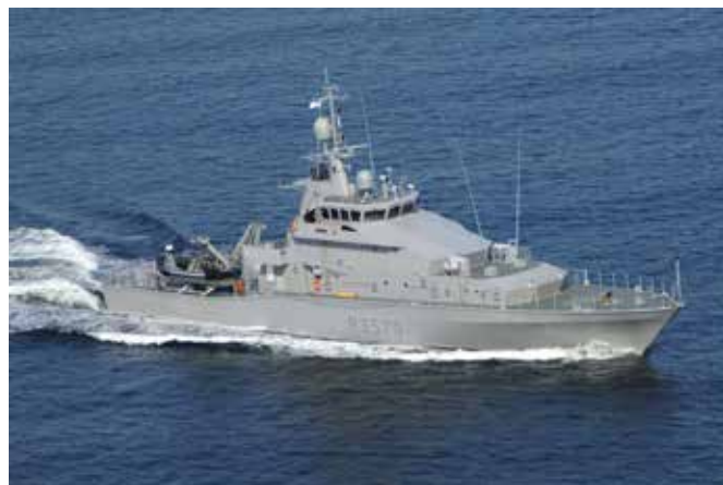
Top of page: Calm seas and a clear day off the coast of the South Island, and no opposition forces in sight.

It began well, somewhere north of Banks Peninsula, in calm waters and broad daylight. TAUPO's seaboat was on its way to shore to pick up the Special Forces team. "Ship's Company were getting pretty excited, we were looking like pulling it off." Then the call came: HMNZS CANTERBURY had been spotted, about 14 miles out. She had not seen TAUPO right away, but that didn't last long. "We watched her for about half an hour, then she hailed us, asking our intentions. But by then we had successfully extracted the