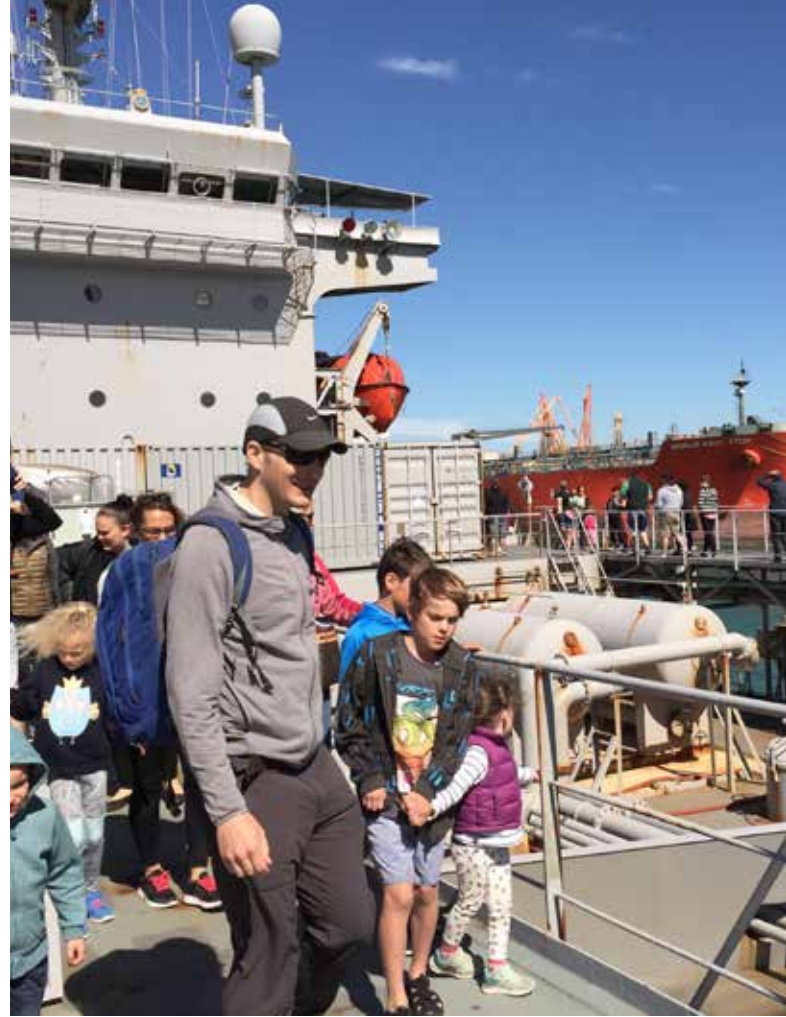
Above: Locals enjoy the last Ship Open To View event for ENDEAVOUR. Below: Visitors encircle the walkways on ENDEAVOUR.