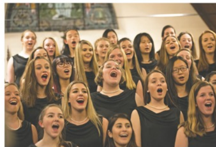
The chorale performs during the annual Lessons and Carols service at Saint Mary's Chapel.

"This event is a way for students, alumnae, families and the Raleigh community to come together on one special night to celebrate the spirit of Christmas."