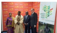
President Emeritus of IFAD Kanayo Nwanze (second right).

ROME – As Kanayo Nwanze cleared his desk at IFAD, questions have been raised over the award of the dlr 100,000 Africa Food Prize to the head of the UN agency by the African Green Revolution Forum in the latest of a string of controversies that marred the flamboyant Nigerian honcho's turbulent eight-year presidency, UN sources said Wednesday.