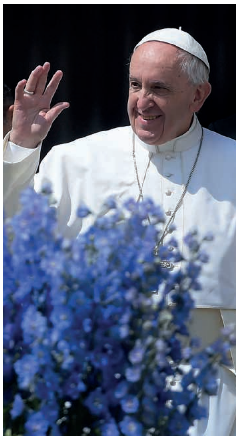
Pope Francis attends the Easter Mass in St. Peter's Square at the Vatican on April 16, 2017.