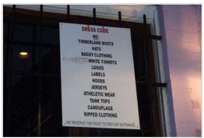
The long list of dress code no-nos, which includes white t-shirts, at Adams Morgan nightclub Heaven and Hell.

Back in September, D.C. personality/musician/promoter Dre All Day showed up at 14th Street NW's Policy nightclub and restaurant for a music video release party. Being the well-known man about town that he is, he immediately hit the red carpet. He posed, holding two giant bottles of vodka, while various photographers snapped away. After he left the carpet, Dre