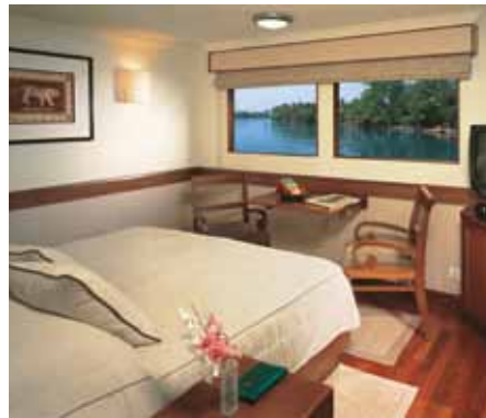
Right: Relax in your suite with a changing vista of India's countryside. Below: The Oberoi Motor Vessel Vrinda sails on the serene Vembanad Lake.

plots of land occupied by tiny houses, and a few chickens and the odd cow negotiate narrow paddy field tributaries where each seedling is blessed before being planted. Along the way, onshore excursions include a visit to St Mary's Church, established by St Thomas in 1721 – it's said that all who enter are imbued with a sense of tranquillity and peace; and the enshrined half-statue of Lord Buddha at Karumadi. Back onboard, spectacular sunsets at the Vembanad Lake anchorage are followed by dinner featuring fusion creations like crab and orange salad and masala prawns, before another equally colourful spectacle – an evening performance of the highly ritualised Kathakali dance, which tells stories from the ancient Hindu epics Ramayana and Mahabharata ; and the classic dance form Mohiniattam, or "dance of the