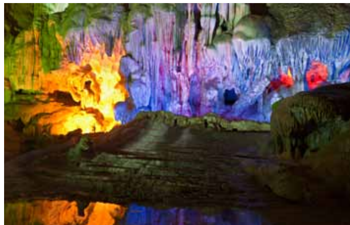
From top: Halong Bay’s countless limestone pillars greet guests on Paradise Peak; The illuminated Sung Sot cave is one of Vietnam’s hidden gems.