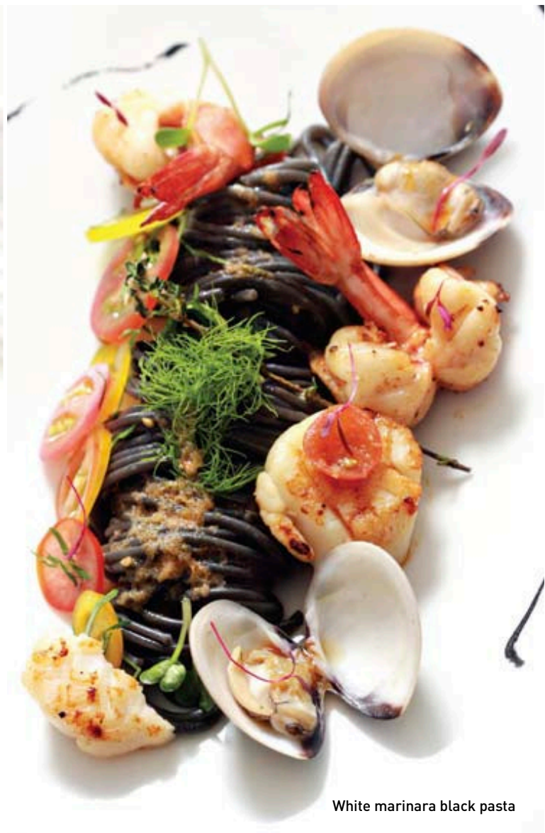
White marinara black pasta