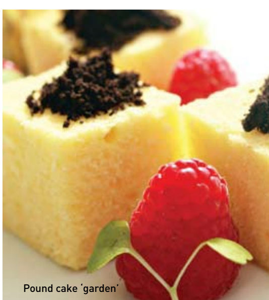
Pound cake 'garden'