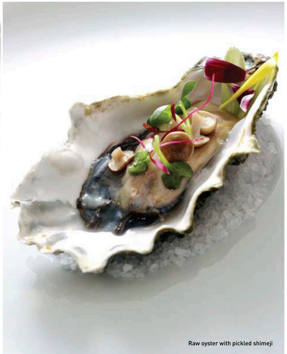
Raw oyster with pickled shimeji